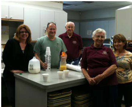
Anti-hunger efforts – We serve at New Journey soup kitchen (above) and field a CROP Walk team (below).