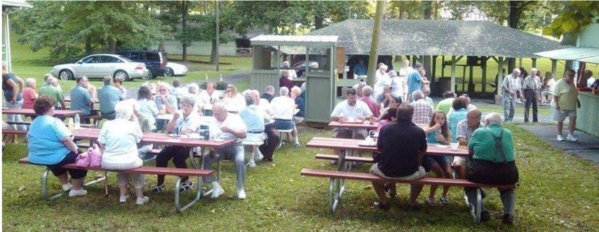
Peach Festival in the Church Grove – Events such as this one keep Bern Reformed as a center of community life in Bern and Penn townships.