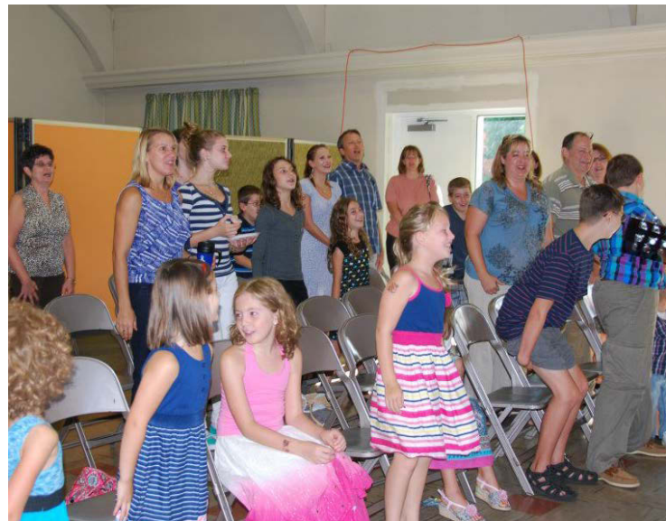
Christian Education's Rally Day – All ages, but especially our children, benefit from Sunday School classes and special events.

STEWARDSHIP is the MEANS ... Our MISSIONS are the ENDS!