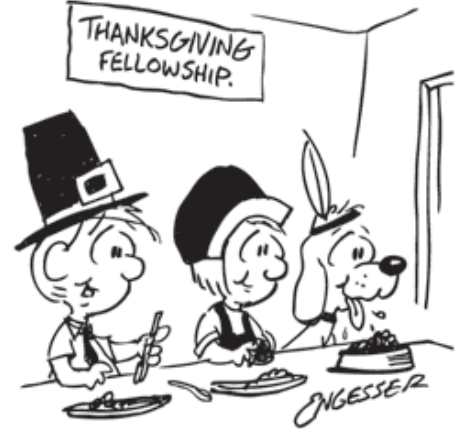
"I'd prefer turkey nuggets."

Answers: 1. Give, 2. praise, 3. LORD, 4. proclaim, 5. name, 6. make, 7. known, 8. nations, 9. done, 10. Sing, 11. him, 12. praise, 13. tell, 14. all, 15. wonderful, 16. acts. Give praise to the LORD, proclaim his name; make known among the nations what he has done. Sing to him, sing praise to him; tell of all his wonderful acts. (Psalm 105:1-2, NIV)